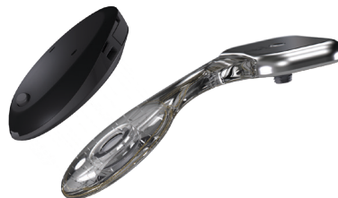
Bone conduction hearing implant